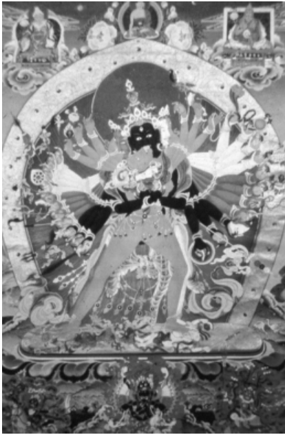
Fig. 1. Kālacakra and Viśvamātā Consort Couple.

In order to cultivate nondual perception of conventional and ultimate, tantric practitioners attempt to generate within themselves the qualities of enlightened Buddhahood by identifying with the Buddha's qualities of "body" (Skt. kāya ; Tib. sku ), "speech" (Skt. vāc ; Tib. gsung ), and "mind" (Skt. citta ; Tib. thugs ). This they accomplish throughout the empowerment and during tantric practice in general by engaging "the three M's"— mudrā , mantra , and maṇḍala . Students use mudrā , a term that derives from the Sanskrit root mud , meaning "to be merry or glad or happy, to rejoice," to identify with the body of Kālacakra. The term designates particular gestures of the hands and fingers, some of which involve interlocking the fingers. In more specialized ritual texts that refer to yogic practices of a sexual nature, the term mudrā also often refers to a female consort of a male yogic practitioner. The ritual manipulation of women for the benefit of male practitioners' yogic realizations, though not universally condoned, is a real yet problematic element of both medieval and contemporary tantric practice.